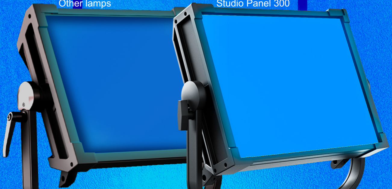
Studio Panel 300